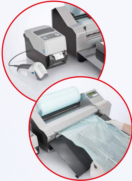
Sealing of pre-formed sterile barrier systems